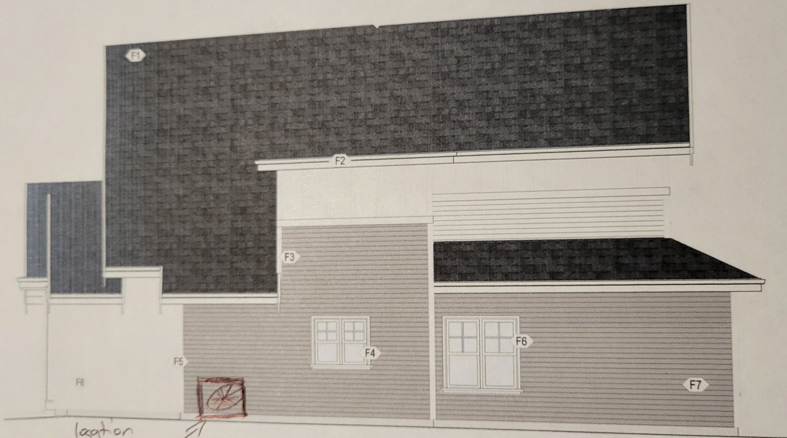
2 RIGHT ELEVATION SCALE: 1/4" = 1'-0"