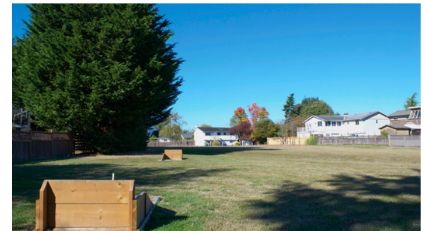
Horseshoe pits and green space