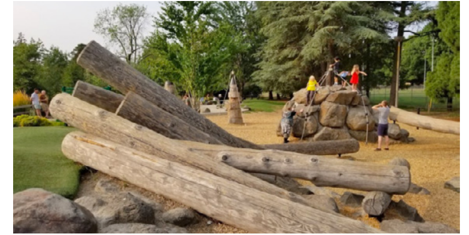
All Ages Nature Playground