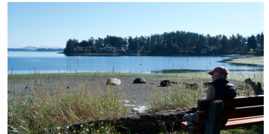
Bank/Shore Improvements at Ardwell Beach access