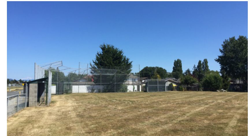
Baseball backstop and dugouts