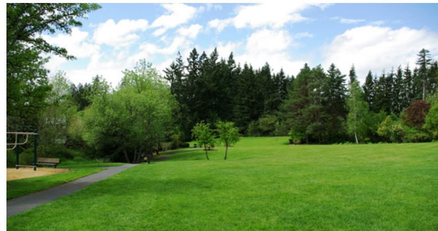
Open Green Space