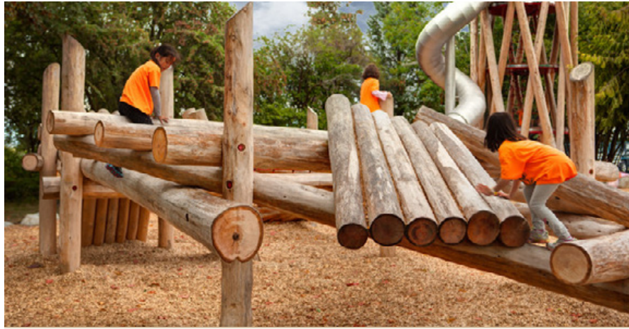
All Ages Nature Playground