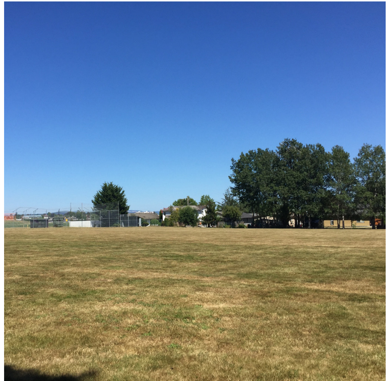
Large open space and underutilized baseball diamond at Brethour Park