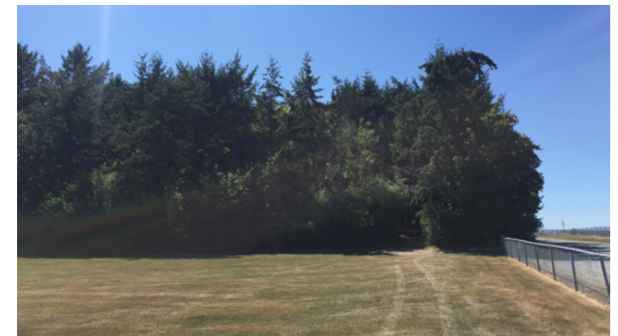
Open green with forested area and fence