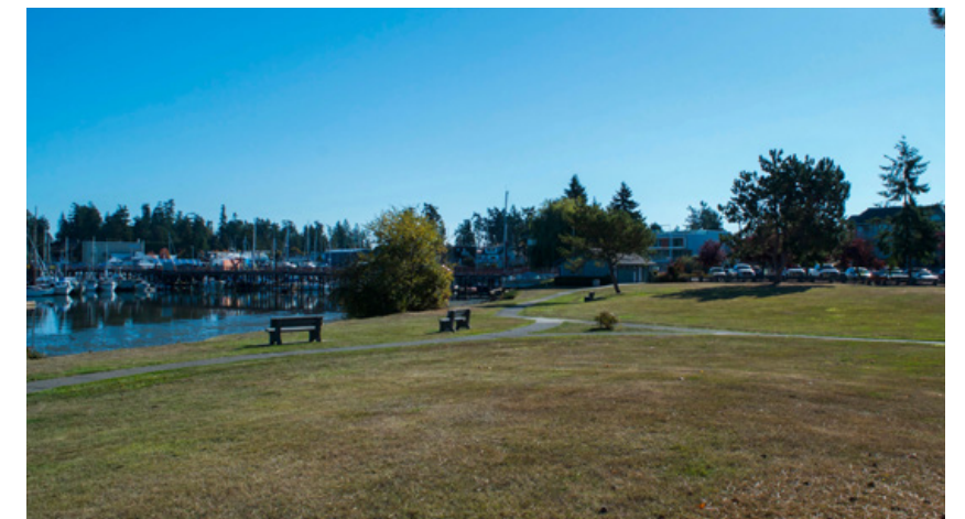
Waterfront path and benches