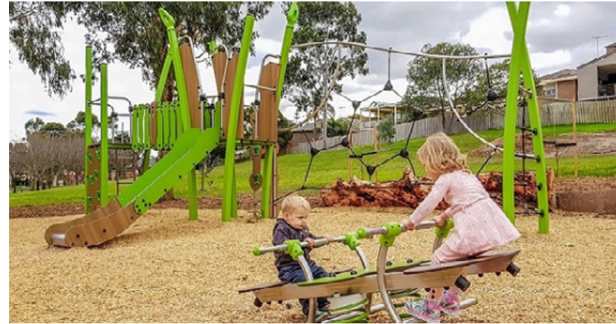
All Ages Playground