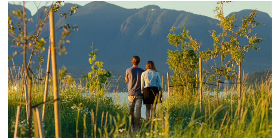
Urban Habitat Landscape