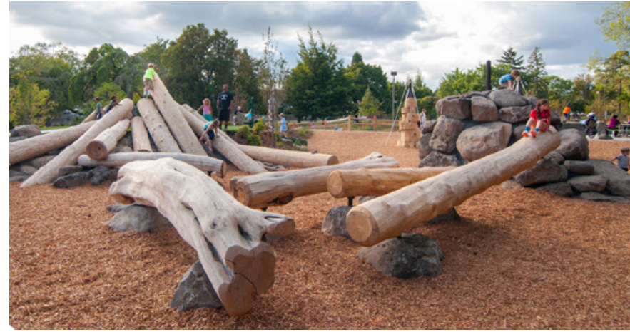
All Ages Nature Playground