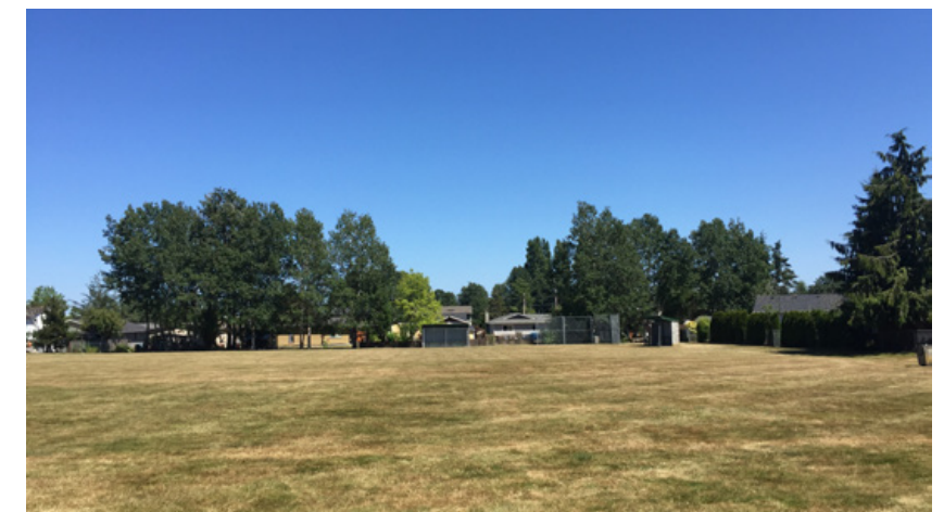
Open green and ball fields