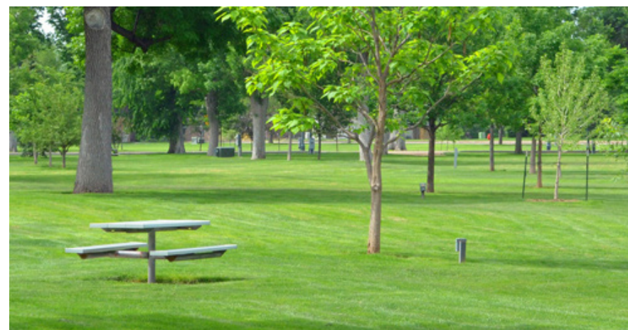
Treed Green Space