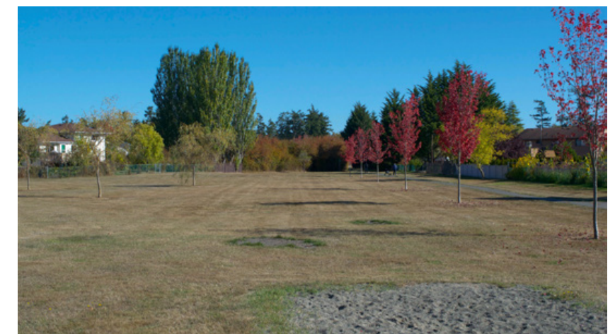
Open green space, path, and tree plantings