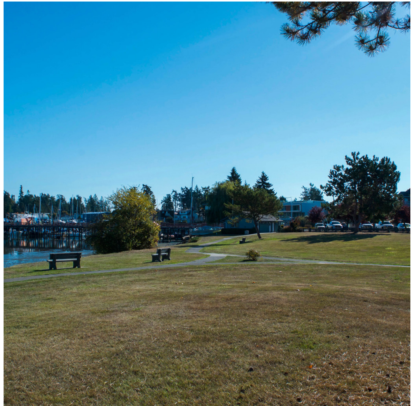
Aging path and benches at Resthaven Park waterfront