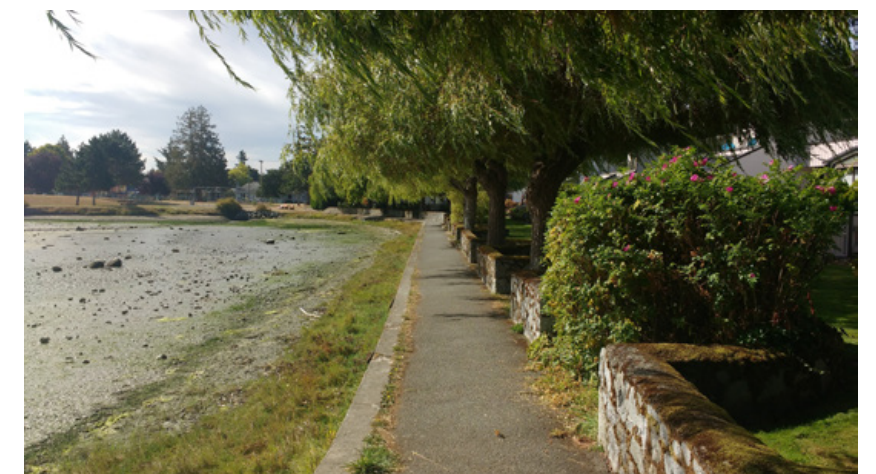
Path to Resthaven Park