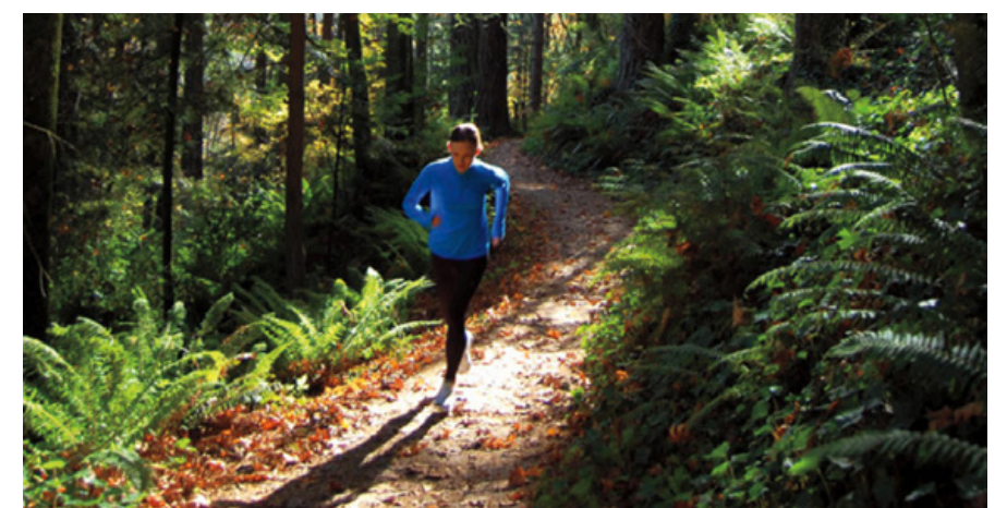
Urban Forest with Managed Invasives and Trails