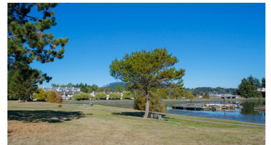
Harbour and path to Resthaven Island