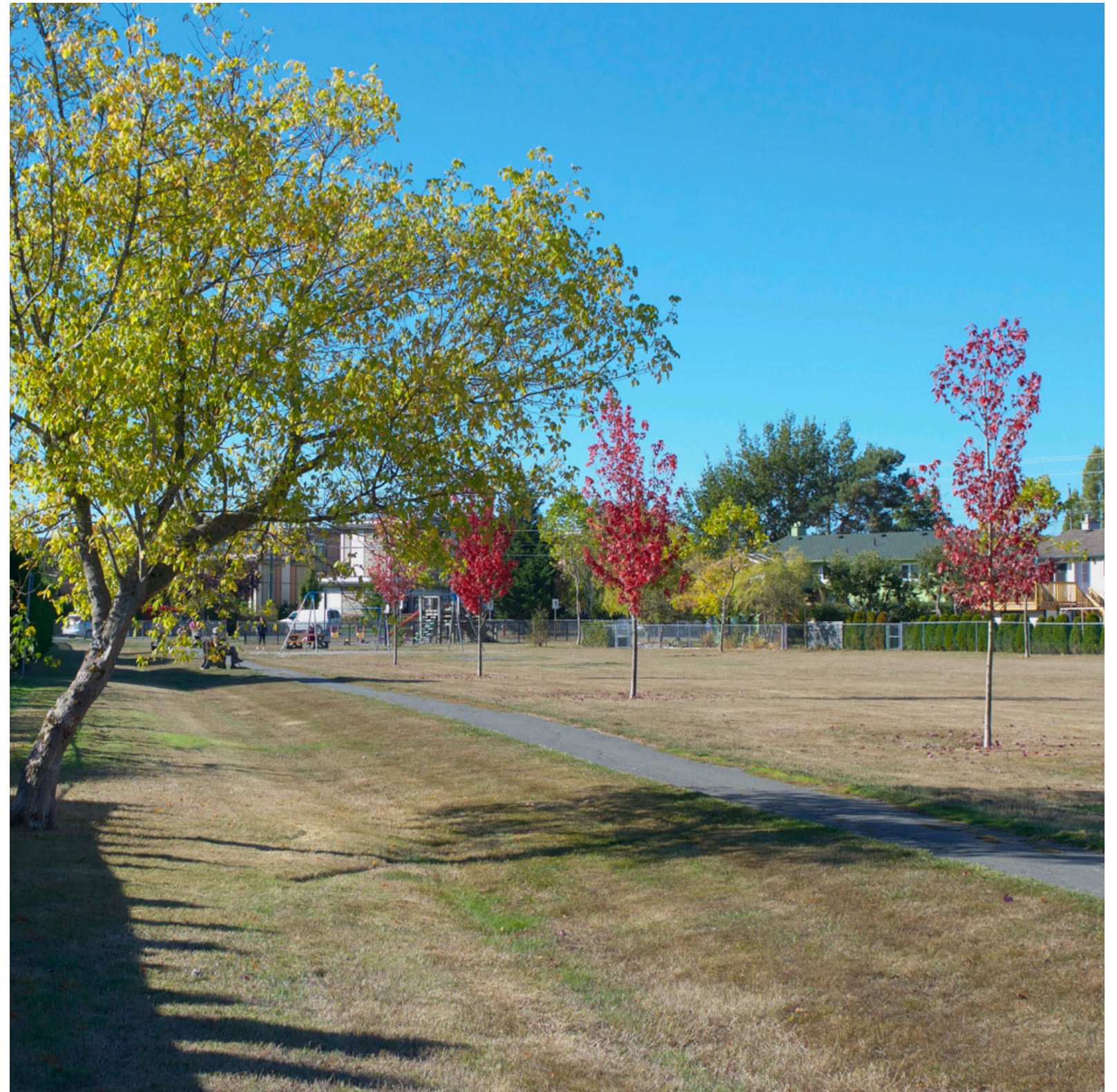
Aging path and young trees at Rathdown Park