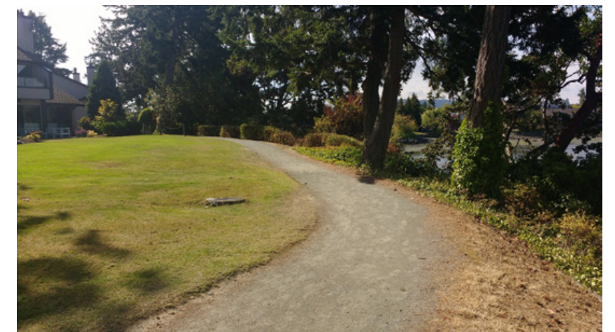
Typical path section and green space