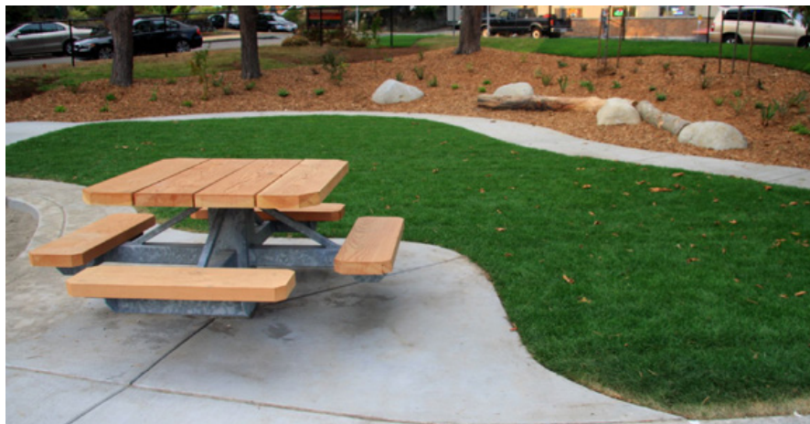
Seating and Picnic Area