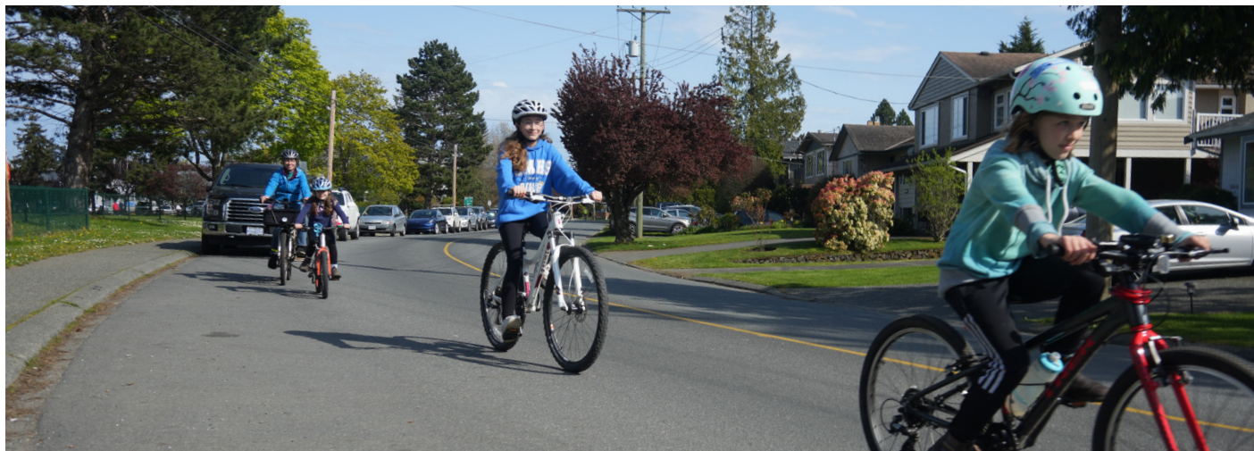
|| Kids enjoy a sunny ride through Sidney. An Active Transportation Plan could help make it safer for people of all ages to walk, bike, and roll.